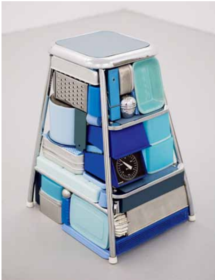
Left: Domestic Kitchen Planning , 2010. Kitchen stool, kitchen equipment, 40 x 60 x 45 cm.