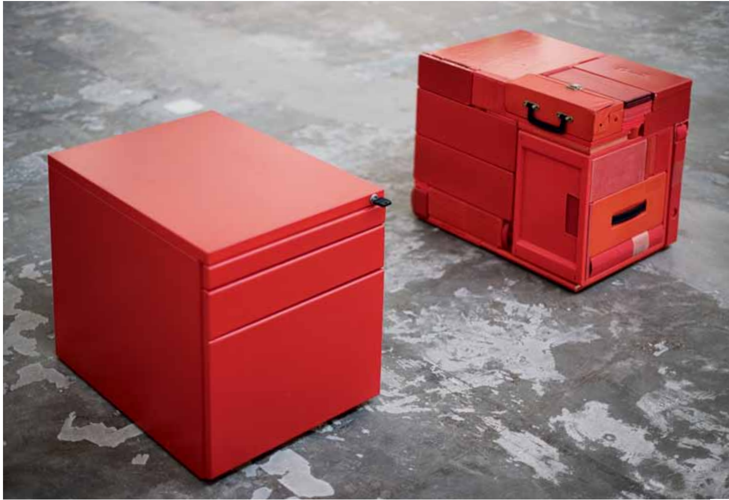
Top: Doppelgänger , 2010. Red furniture, red objects, 50 x 60 x 70 cm x 2.