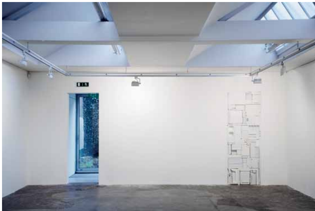
This spread: Ghost IV , 2010. White objects, 90 x 250 x 70 cm. Installation view: Galerie Ramakers, The Hague (NL).