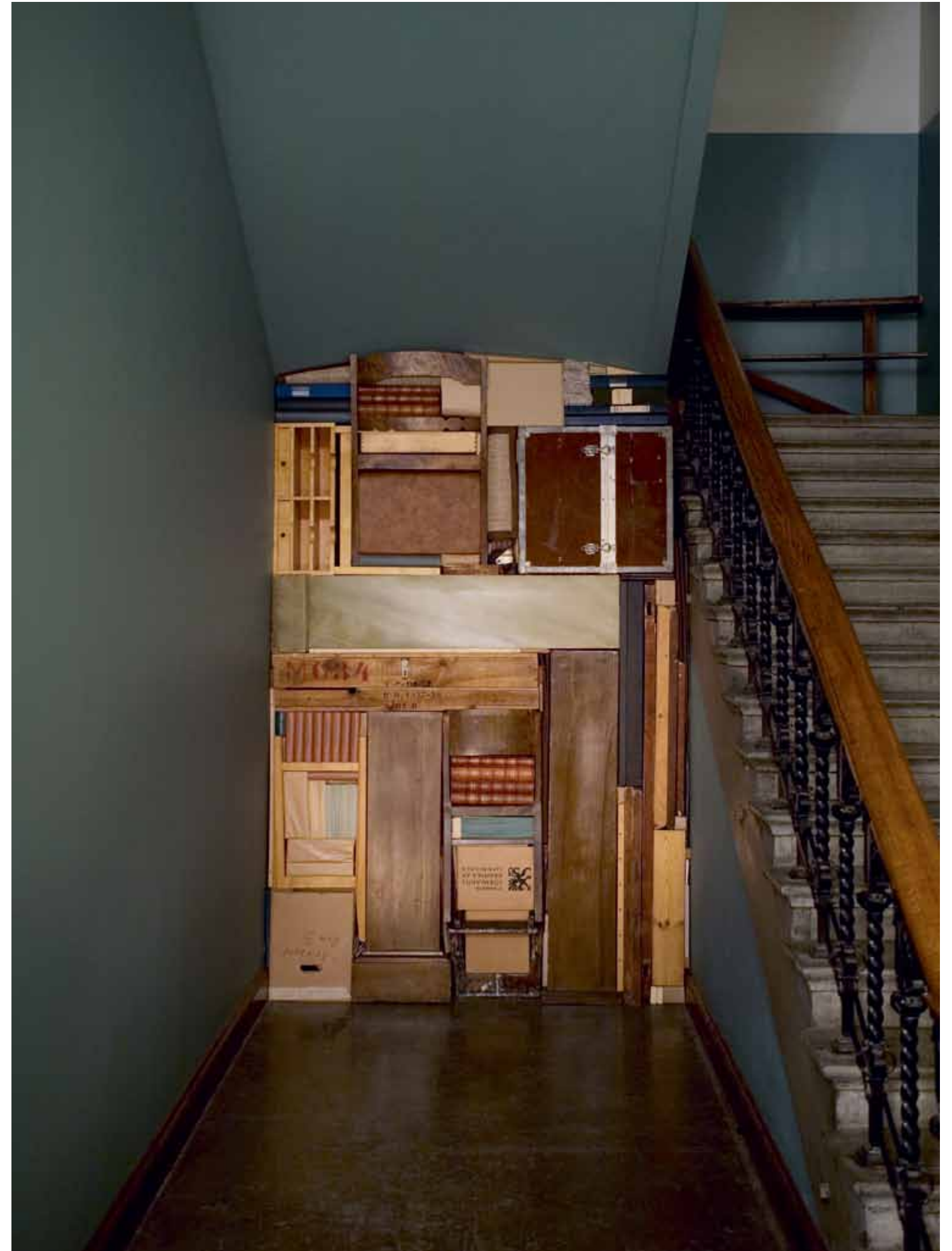
Right page: Konstakademien , 2010. Objects from the storeroom at Konstakademien, Stockholm, 170 x 260 cm. Installation view: Konstakademien, Stockholm, Sweden